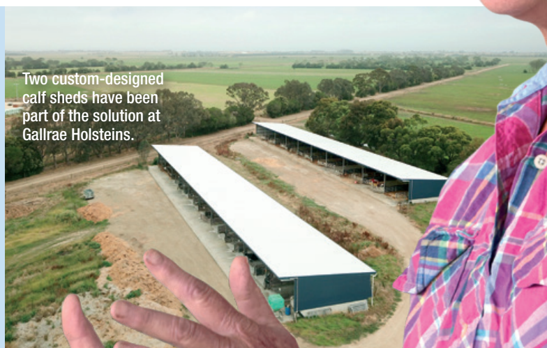
Two custom-designed calf sheds have been part of the solution at Gallrae Holsteins.